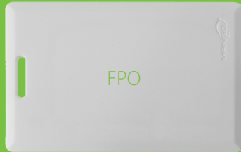
Thick / Clamshell Card