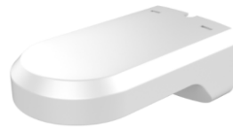
DS-1294ZJ Wall Mount