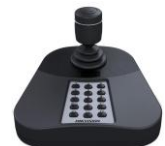
DS-1005KI USB Joy-stick