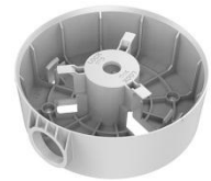
DS-1280ZJ-PT3 Junction box